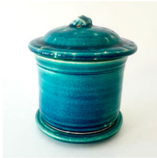
Functional ceramic piece by Betty Woodman